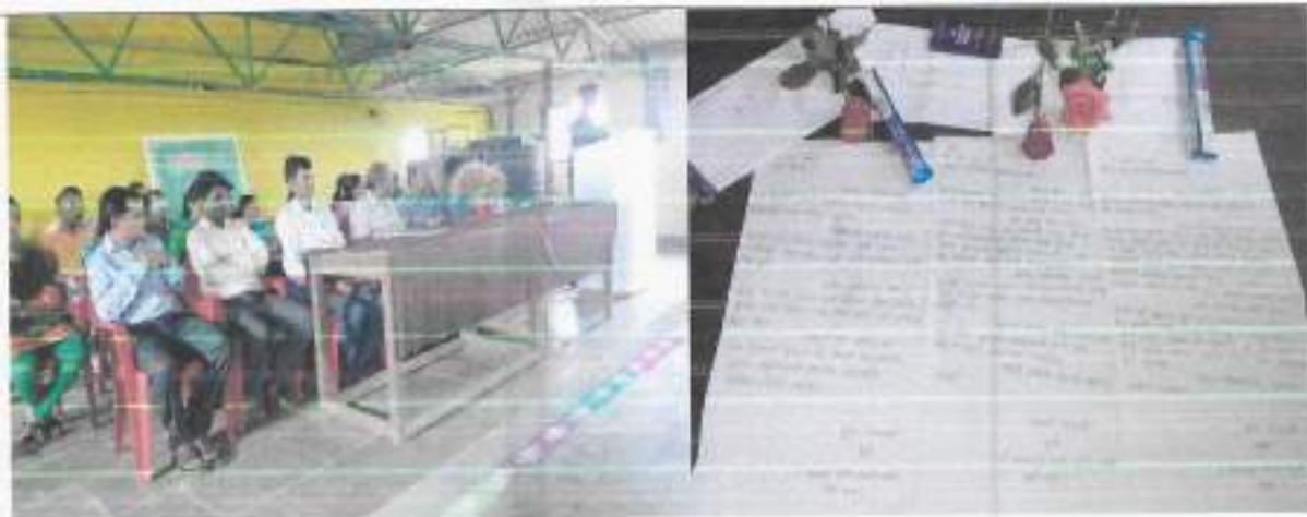
Celebration of Gurupurnima