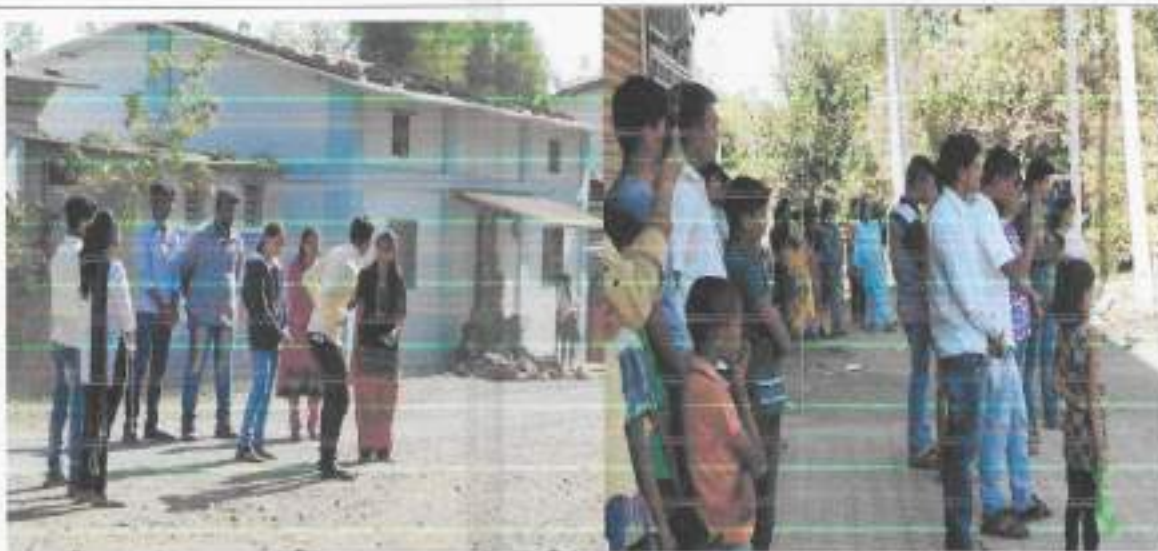
MARATHI BHASHA DIVAS