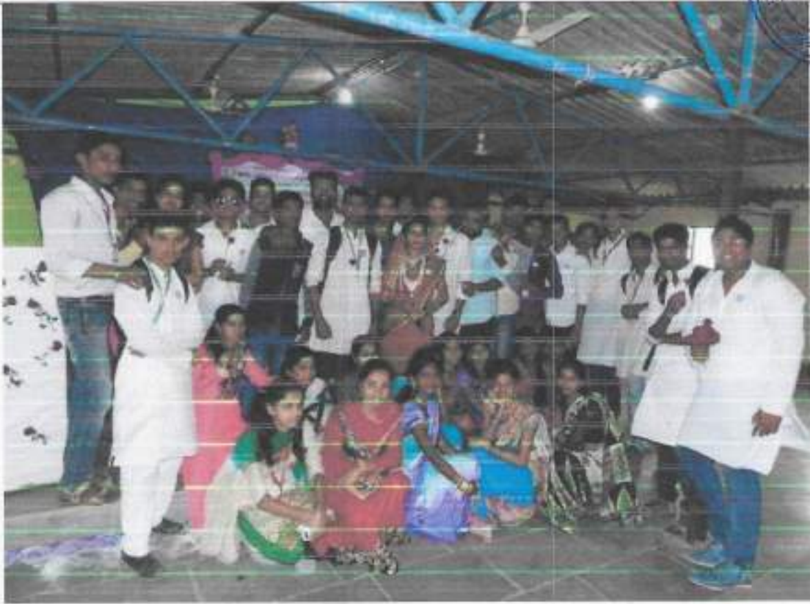
BIRTH ANNIVERSARY OF SWAMI VIVEKANAND