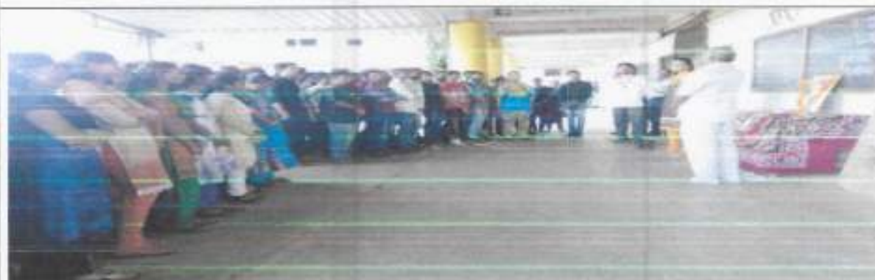
LOKMANYA TILAK JAYANTI