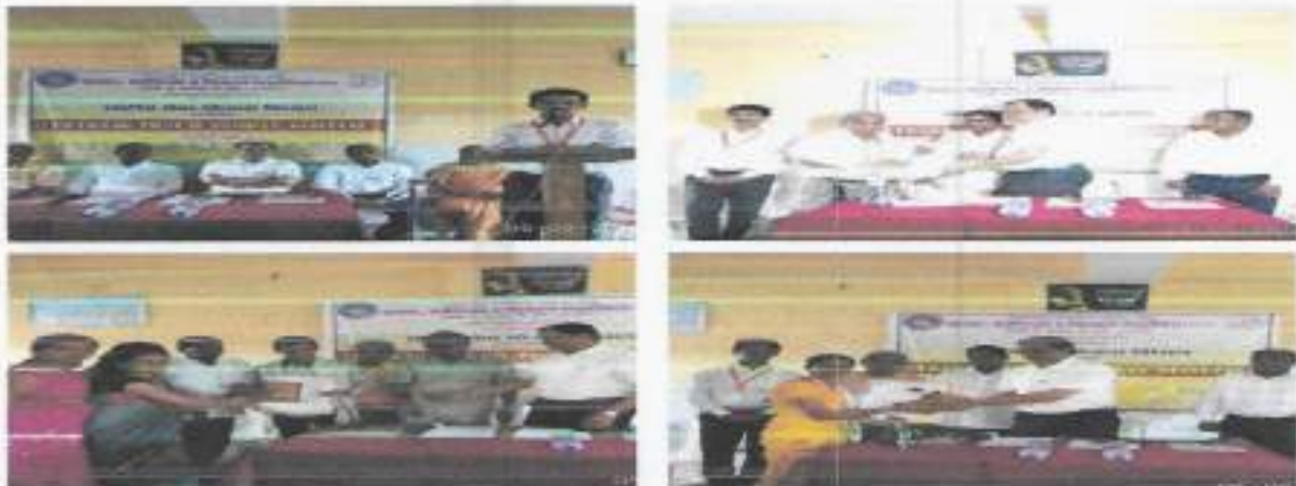
Celebration of Teachers day