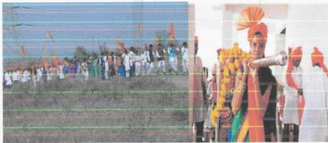
SHIVOTSAV SOHALA 2016