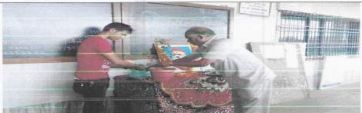
DEATH ANNIVERSARY OF LOKMANYA TILAK