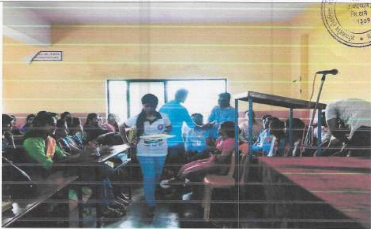
Celebrating Guru Pournima