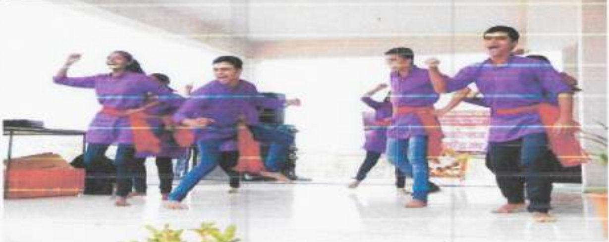
SHIVOTSAV SOHALA 2016