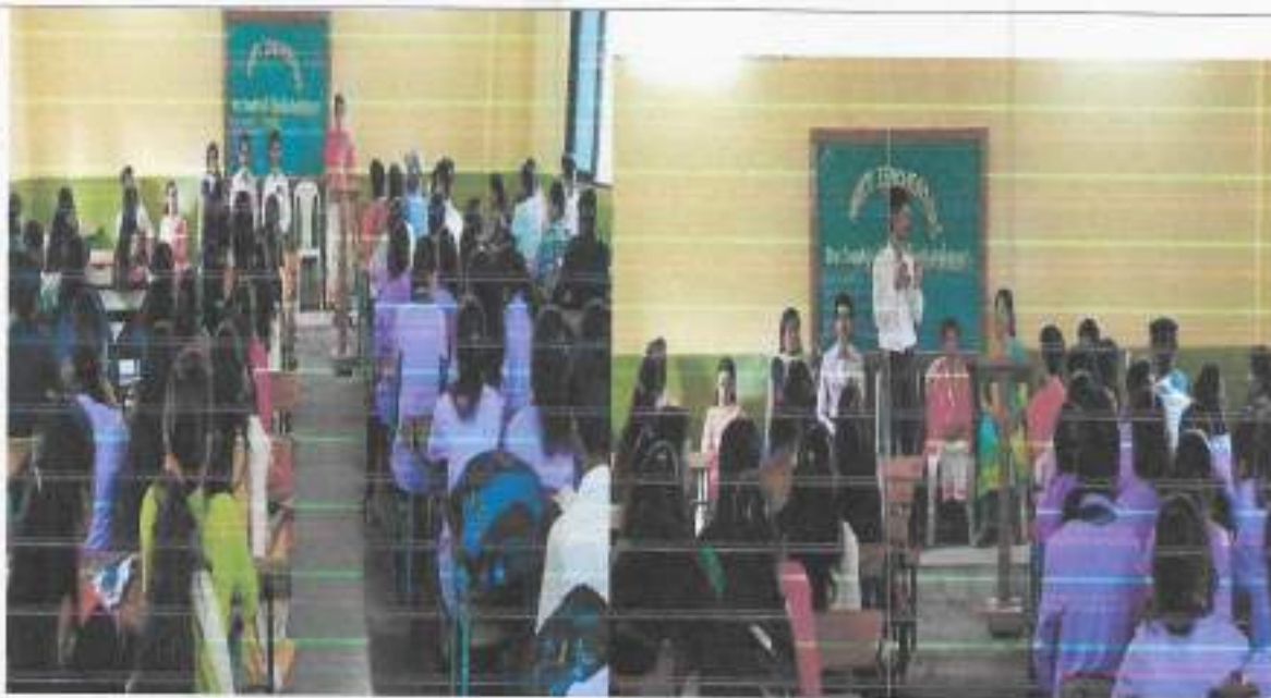
Celebrating Teachers Day