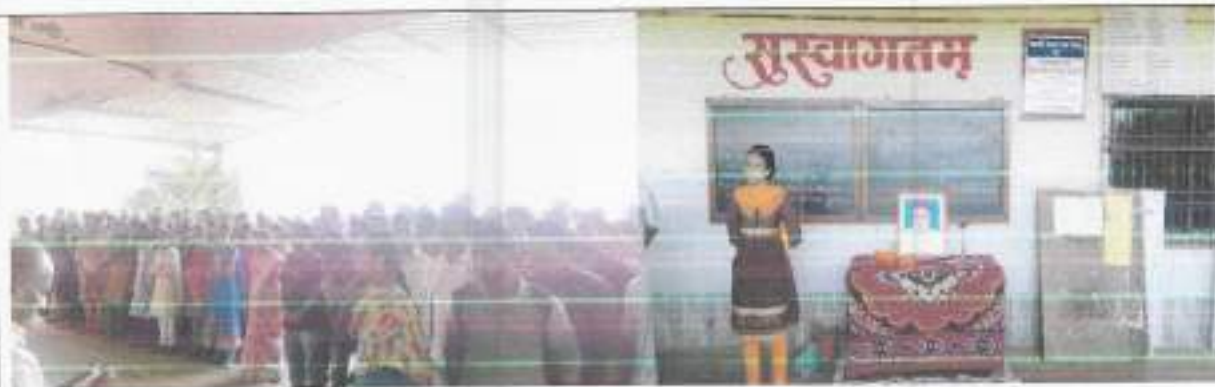
DEATH ANNIVERSARY OF LOKMANYA TILAK