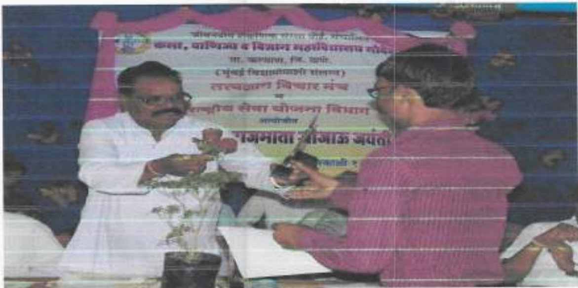
BIRTH ANNIVERSARY OF SWAMI VIVEKANAND