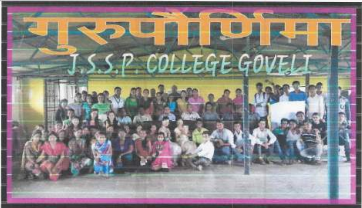
Teachers day programme arranged by commerce and BAF dept