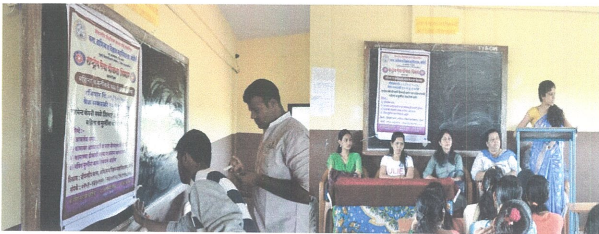
MAHILA ROJGAR MELAVA

Many families benefited from this programme. This initiative saved many families from falling apart. But most importantly it has helped women understand their worth and increased their self- esteem.