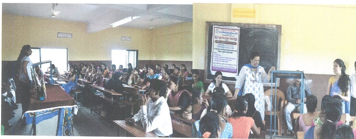
MAHILA ROJGAR MELAVA