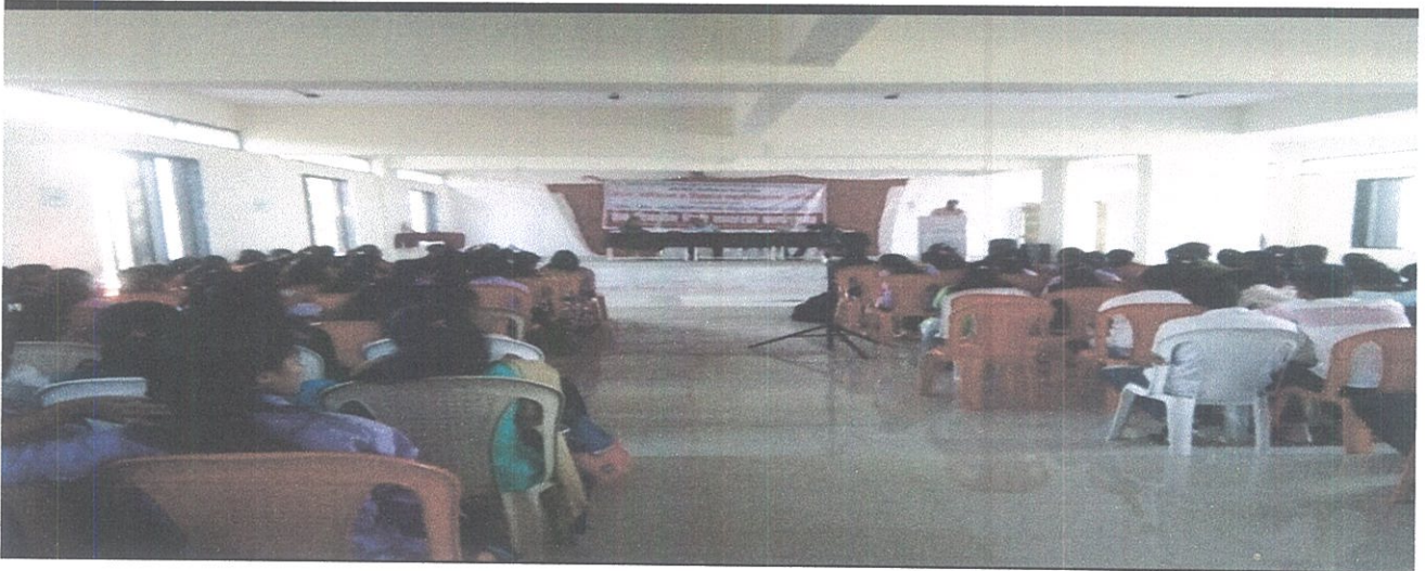
One Day Legal Literacy Workshop