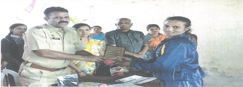
MAHILA SANMAN SOHALA / INTERNATIONAL WOMEN'S DAY