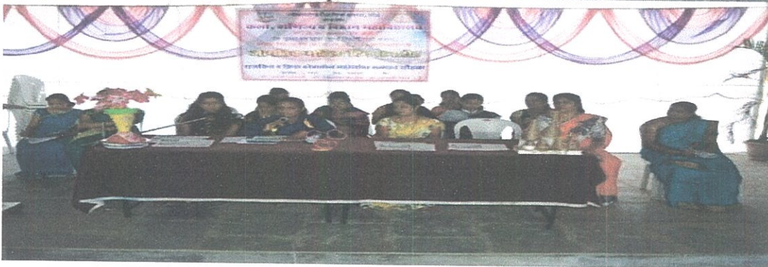
MAHILA SANMAN SOHALA / INTERNATIONAL WOMEN'S DAY